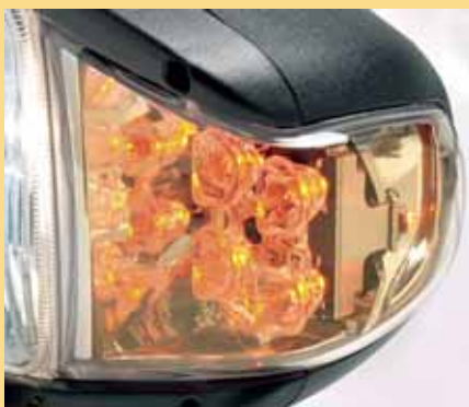
LED Indicator unit